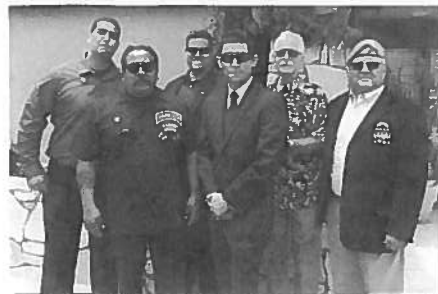
Modern era rangers who represented at the memorial service.